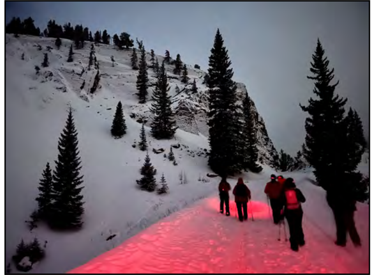
Full moon on Boreas Pass