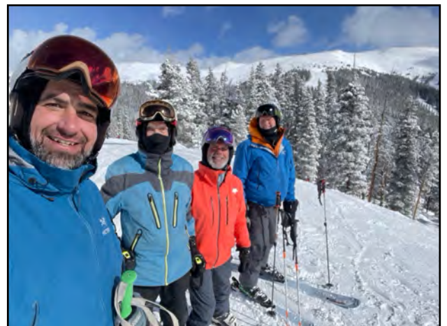
Downhill at Keystone