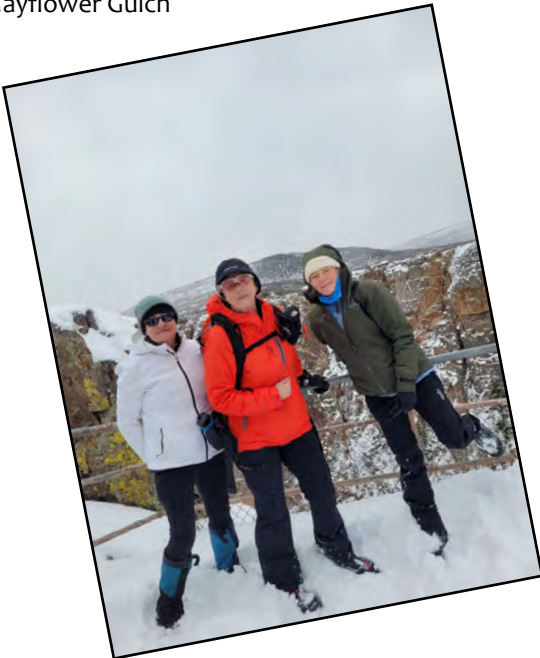
B l a c k C a n y o n