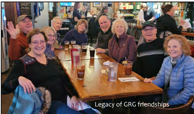
Legacy of GRG friendships